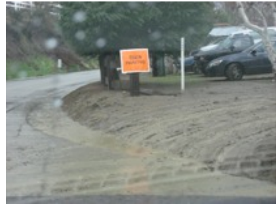
Below: an accident at Lobo and Triunfo