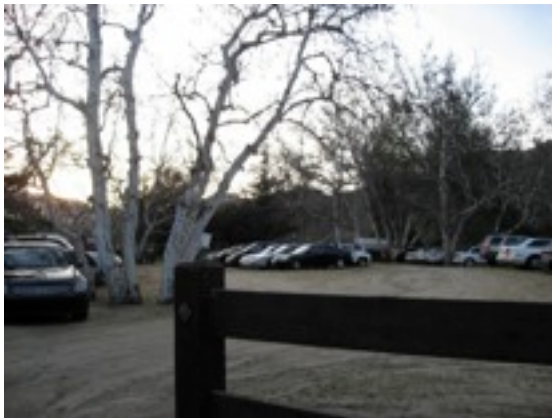
Below: the isthmus on Lobo